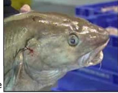
Cod stocks will not make a full recovery even with a total ban

The International Council for the Exploration of the Sea (Ices) has said there should be a total ban for 2007.