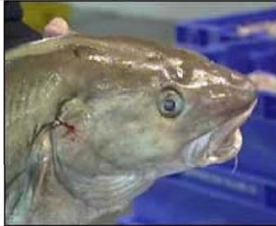
Cod stocks will not make a full recovery even with a total ban

A complete ban on cod fishing has again been recommended by experts until severely depleted stocks recover.